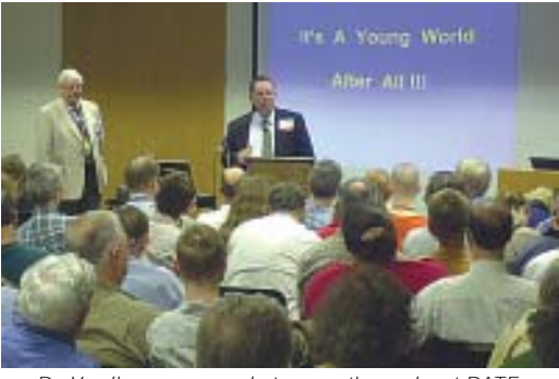
Dr. Vardiman responds to questions about RATE.

Dr. Andrew Snelling described his tabulation of radiohalos in granite at several locations around the world and an updated model for their formation in brief periods of time. Radiohalos are residual evidence of rapid nuclear decay damage surrounding radioactive centers containing Uranium, Thorium, or Polonium in granites. These miniature discolored regions in rock are formed in periods as short as days or weeks only in catastrophic