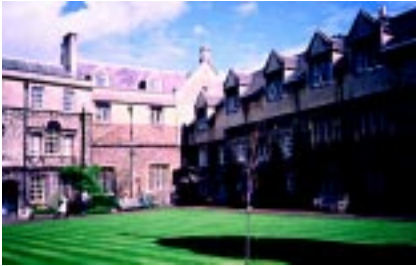
Hereford College at Oxford University.