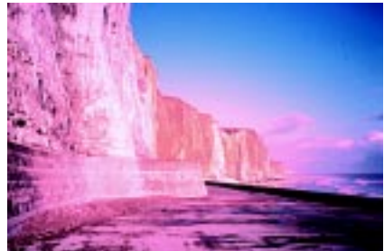
Chalk Cliffs near Brighton.

Keep your eyes open for announcements in Acts & Facts about the England Tour starting in the spring of 2002. The tour will probably be about 10 days in length and begin in the last weeks of September or the first week of October of 2002. Cheerio, until next spring. ☺