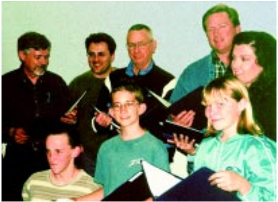
A rehearsal of "The Clue from Ninevah."

When I first began to understand the full significance of this, I would return to public high schools and ask students if they believed in creation or evolution. Most of the students did believe in creation, but when I asked them why, most had no reason—except they had been raised that way. I realized they had no foundation for their belief in creation. Evidently the students' parents and churches were failing to give them the Scriptural and apologetic support for their faith. When I visited college campuses, I