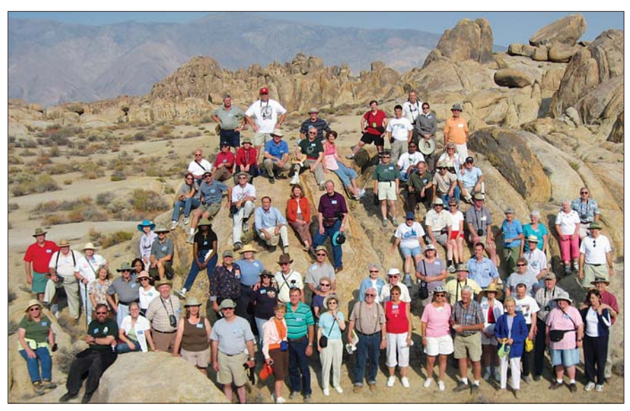
Tour participants on rounded granite boulders of Movie Set Road in the Alabama Hills.

supervolcanoes, the completion of an Ice Age, and the record of rings in the famous Bristlecone Pine, testify of a timescale of thousands of years, not millions. Certainly, since the time when God created all as "very good," the earth has undergone extreme alterations, of which this region is a fantastic showcase. The pilgrimage challenged participants to consider the nature of these changes and the origin of its diversity in light of the propositional truths found in the Word of God.