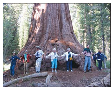
"Big Trees Tour" in Mariposa Grove.

For many participants, Scripture took on deeper meaning, as granitic, volcanic, and sedimentary rocks that are routinely interpreted as spanning billions of years were assigned to pre-Flood, Flood, and post-Flood eras of geologic history. Evidence for catastrophic movements of whole mountains, emplacement of vast "oceans" of granite, the eruption of